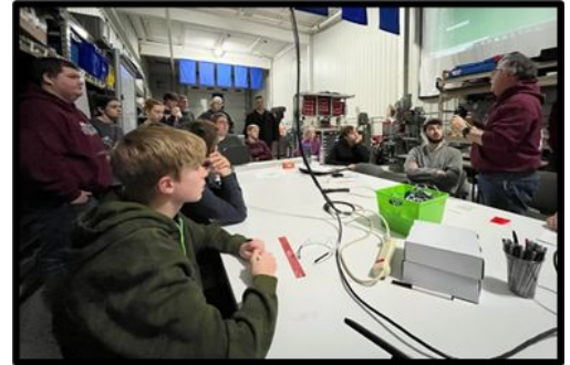
Brainstorming ideas for the 2023 Challenge, Charged Up!

The new game for the 2023 season is called Charged Up! The game challenge is centered around electricity. To score, you need to create a power link with the game pieces. The game pieces consist of rubber traffic cones and inflated cubes. One of the unique aspects about this game is that there is a charging station. On the charging station, we need to balance 3 different robots on it. This is challenging because the station moves like a teeter totter. Our team is very excited to rise up to the challenge and compete.