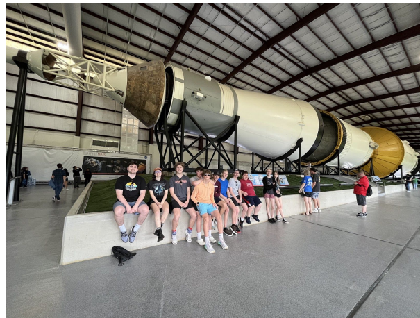
Touring NASA as a Team ( left ).