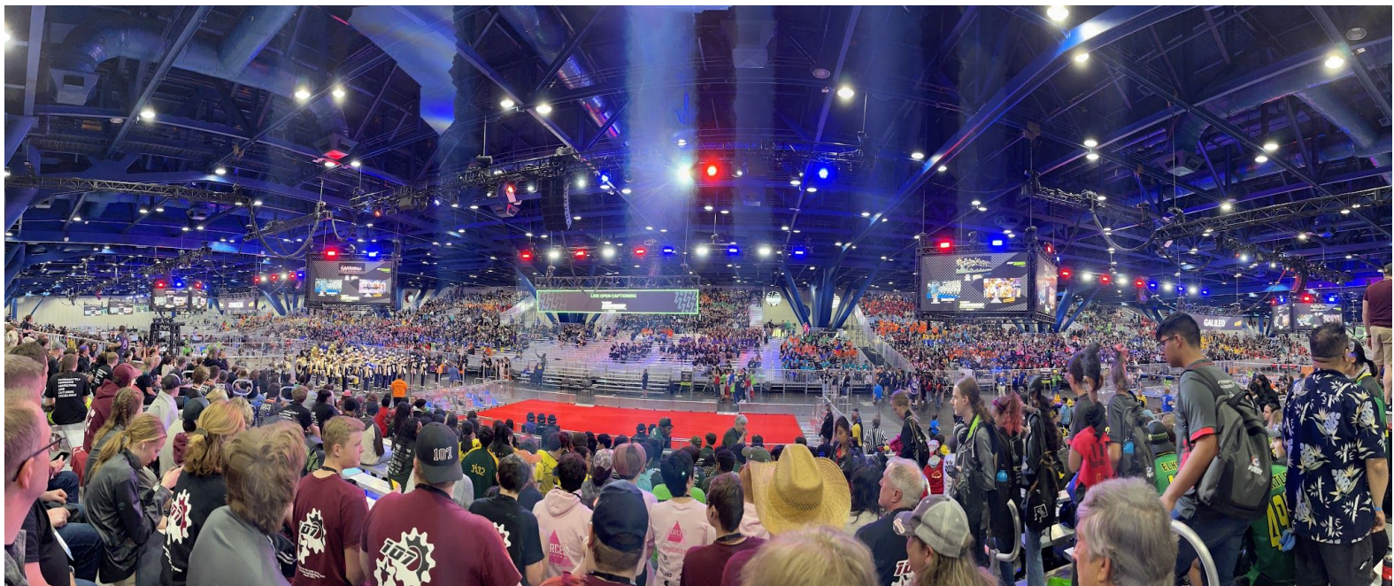
Competing on the World's Stage ( below ).